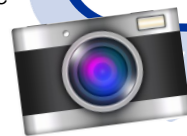
PHOTO MONTAGE Going to a Congress? Take a photo at the event of yourselves in front of their venue, or sign, or at presentation & submit it to us. We would love to put it up on display in the club. Go on, have some fun with the photo.

Have a look and see how your fellow club member mates have gone. If you have competed in a Congress, you may even find your own name listed. A lot of our members enjoy congresses because of its travelling nature — get on the road, get on the plane, enjoy a bridge weekend and have a good time with friends and bridge buddies. How about you take a photo in front of the Congress flag or signage next time when you travel, we would love to share your journey with others by displaying your photo in the club.