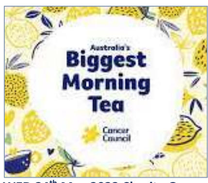
WED 24<sup>th</sup> May 2023 Charity Game Two separate fields 10.00am – 1.15pm