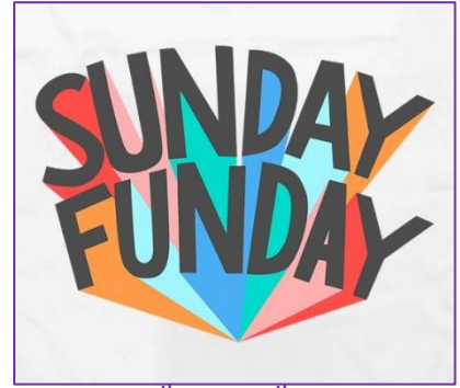
Sunday 10<sup>th</sup> and 24<sup>th</sup> Sept 1.30pm – 4.30pm